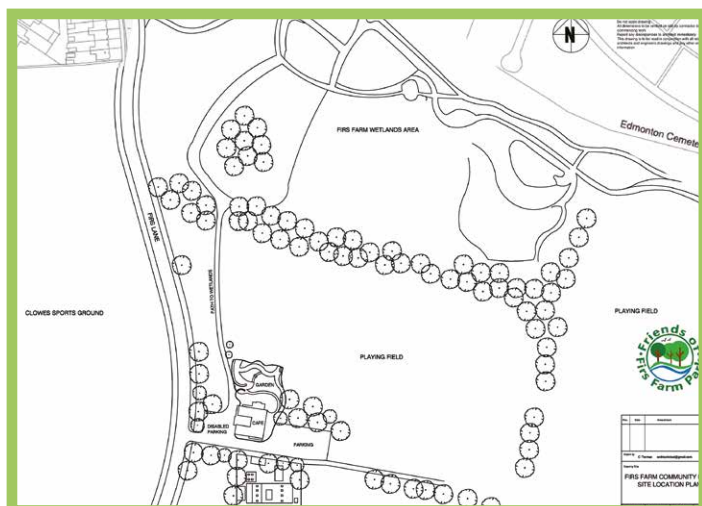
Proposed Café location in Firs Farm