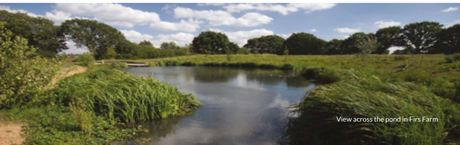
View across the pond in Firs Farm

Can YOUR BUSINESS help to write the next chapter of this environmental success story?