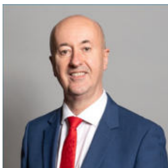
Geraint Davies MP Chair, APPG on Air Pollution

In the aftermath of a disappointing COP26, it is important to promote the improvement of air quality as a central strategy to combat climate change and to improve human health. This means that we should apply the precautionary principle to waste incineration and that Government and local authorities must take time to think again, in particular when considering the health risks of putting plants in urban locations with dense populations.