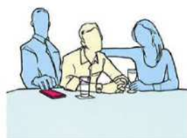
The hugger mugger