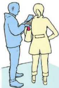
The concealed hand

Pickpockets operate in crowded places often using something such as a newspaper, coat or bag to conceal their actions.