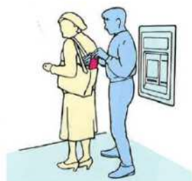
The bank follow off

Watch out for strangers being overly friendly in bars, clubs and large gatherings – often referred to as hugger muggers.