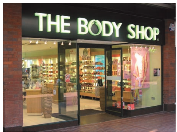
Palace Gardens, Enfield