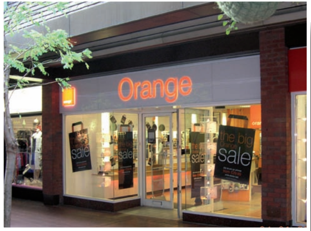
Palace Gardens, Enfield