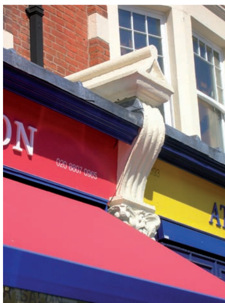
391 Fore Street, Edmonton