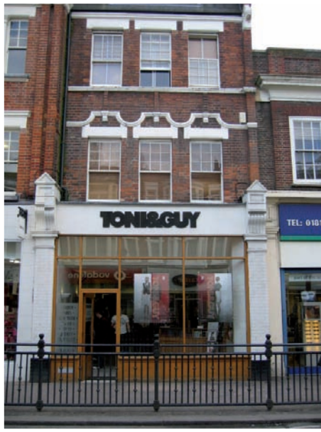
32 Church Street, Enfield