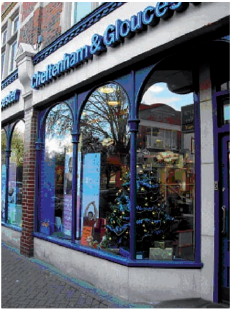
47 – 49 Church Street, Enfield