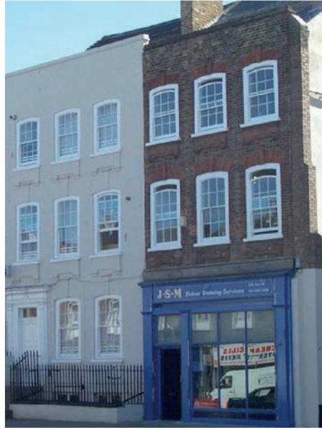
236 Fore Street, Edmonton