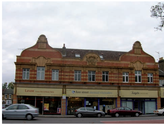
353 Fore Street, Edmonton