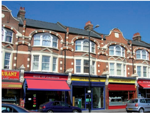
391-397 Fore Street, Edmonton