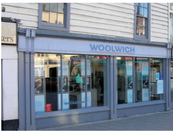
4 The Town, Enfield