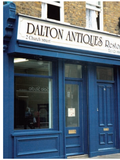
2 Church Street, Edmonton