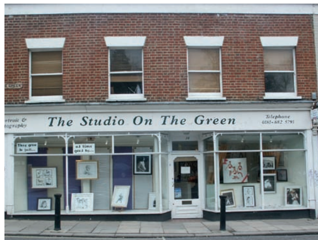
32-34 The Green, Winchmore Hill