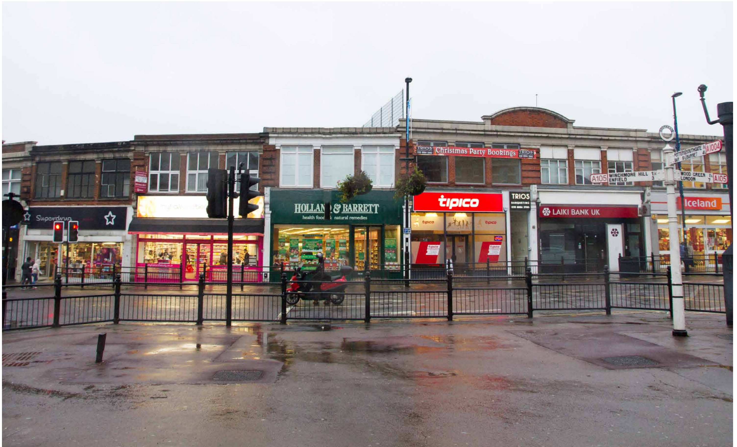
The Triangle island