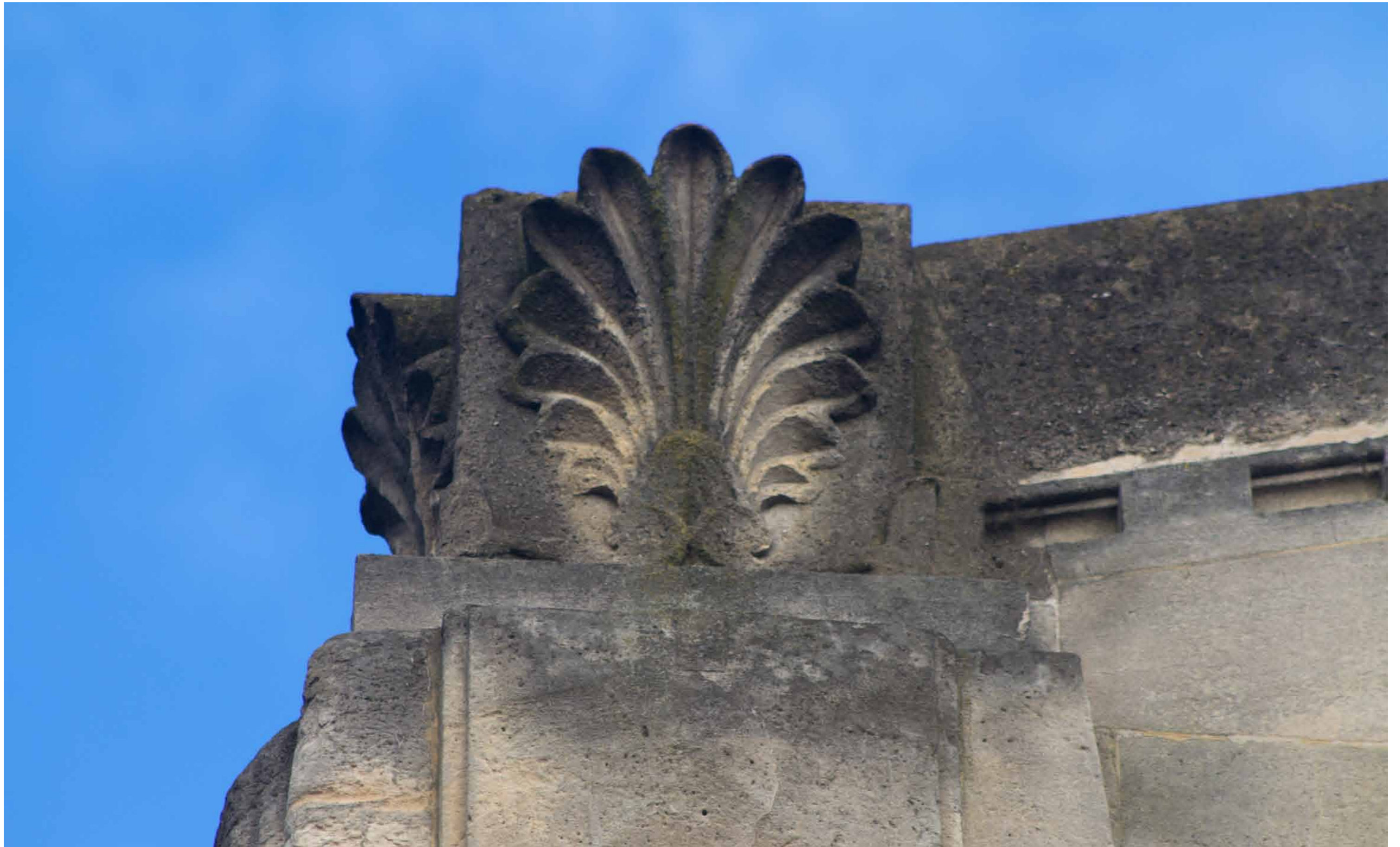
Architectural Feature 1 - clock face