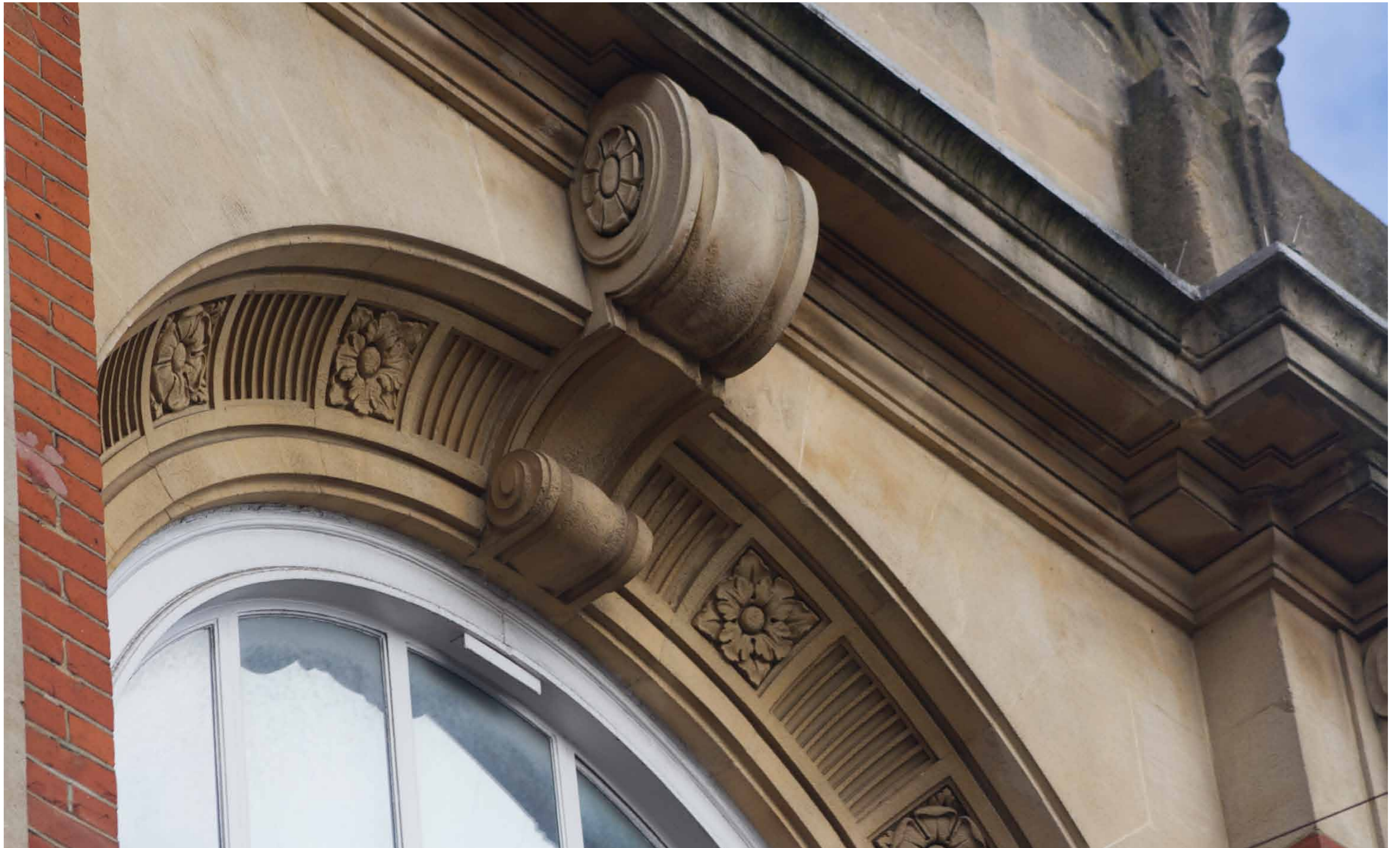
Architectural Feature 3 - Top scroll