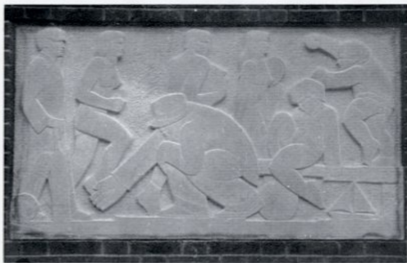
The Bar Relief.